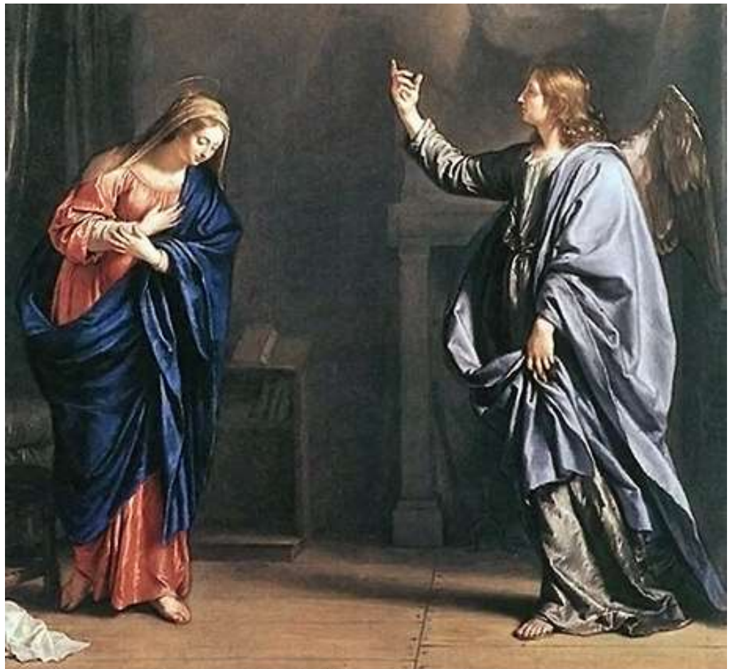
The Annunciation (detail) by Philippe de Champaigne