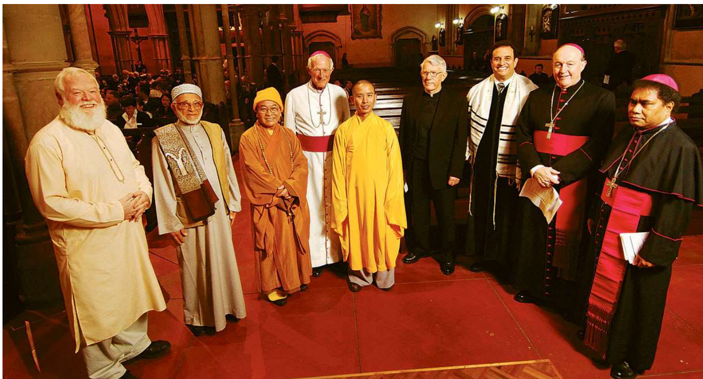
The Catholic Archdiocese of Adelaide has sponsored interfaith relationships for many years. Photograph details Page 24.

The Catholic Church in Adelaide seeking to promote friendship and mutual understanding with Muslims